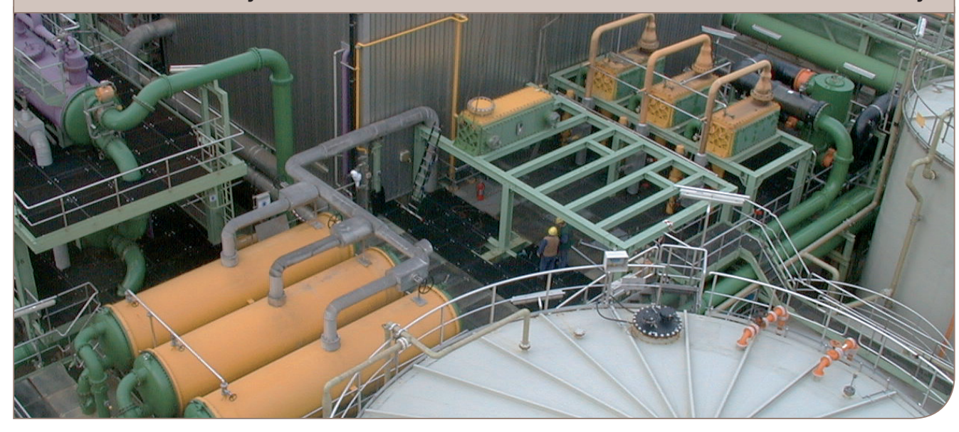
Three Compablocs (top right) with 50% higher capacity replaced three S&Ts (lower left) on half the footprint.

A major European chemical company increased production reliability by replacing shell-and-tube (S&T) condensers with Alfa Laval Compabloc condensers. Utilising only half the space of the old shell-and-tube installation, the Compablocs solved a corrosion problem and at the same time generated considerable savings in capital cost. "Big is not beautiful anymore at this site", says the plant engineer.