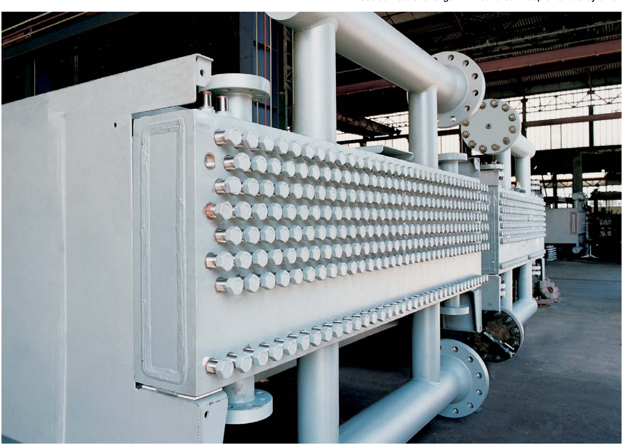
Air-cooled heat exchanger with bundles in duplex and alloy 6Mo

The design of our transfer line exchangers (TLEs) is a good example of how we create value for our customers through smart engineering. Alfa Laval Olmi TLEs have a patented design that makes them withstand the harsh conditions in quench cooling in ethylene plants much better than traditional TLEs.