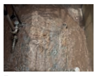
Turn wastewater ...

Product recovery Waste reduction Less disposal costs Water reuse Less CO<sub>2</sub>